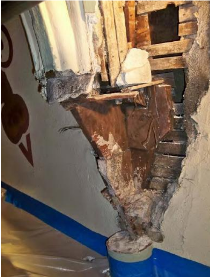
COLUMN UPPER CAPITAL WOODEN BRACKET SUPPORT GRADUAL LONG-TERM MOVEMENT RESULTING IN CRACKING WITHIN SUPPORTING RIBS