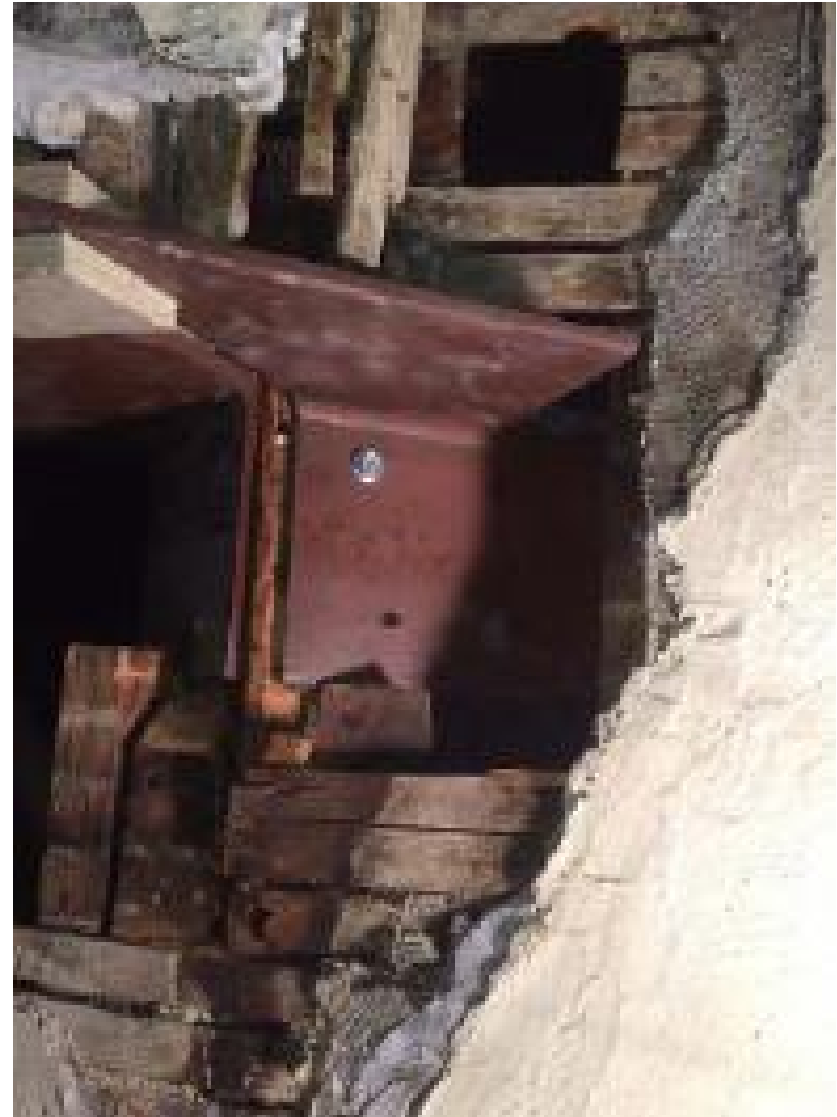
REPAIRED BY NEW METAL BRACKET SUPPORT